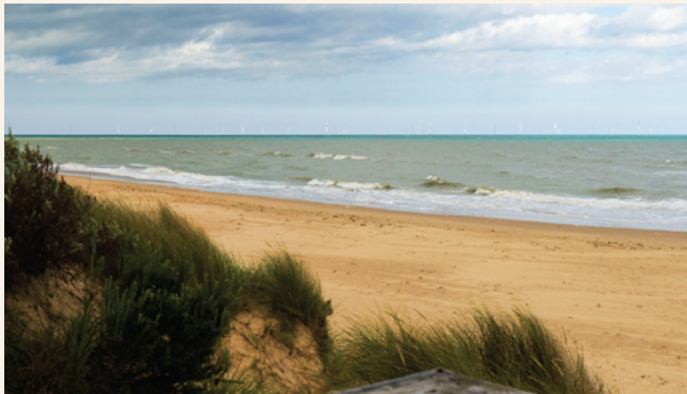
Illustrative view of turbines 10km from Woodside Beach