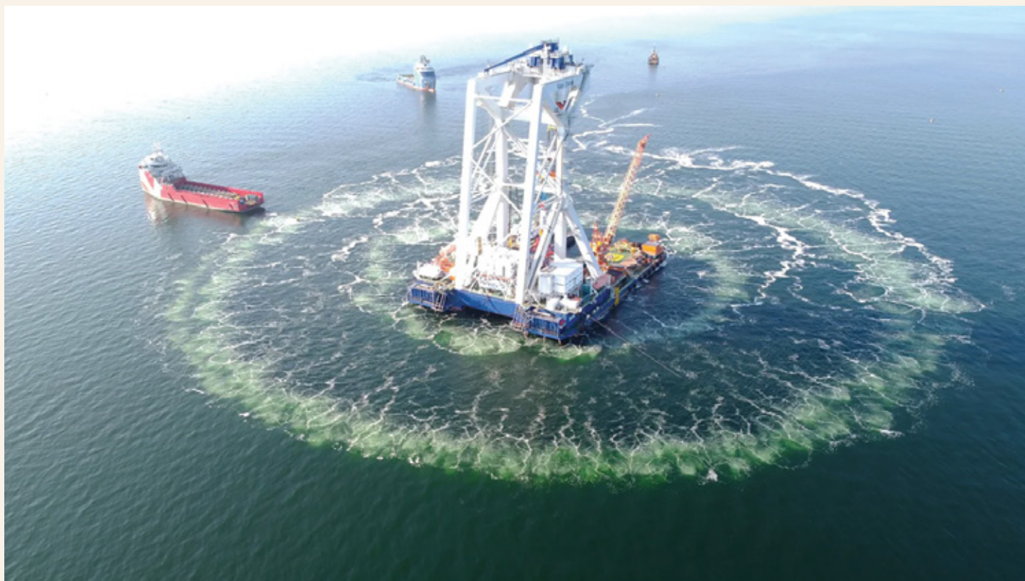
Creating a curtain of bubbles around the area where an offshore wind turbine is being installed can help to minimise the noise

During offshore wind construction, several advanced noise mitigation systems are used to protect marine life including whales. These include double bubble curtains, which create a barrier of bubbles to dampen sound waves, and acoustic deterrent devices that emit sounds to encourage marine animals to move away from the construction area. 6 Additionally, soft-start procedures gradually increase noise levels, allowing marine animals to vacate the area before noise becomes disruptive. 7 Australia will benefit from these innovations by adopting these proven technologies to minimise impacts on marine life from offshore wind projects.